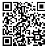
Request a tutor